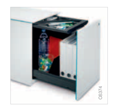
Binder pedestal: Ideal for storing binders and personal belongings.