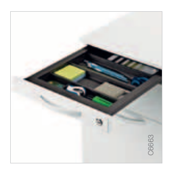
Pen drawer: Standard solution which offers quick access to small items.