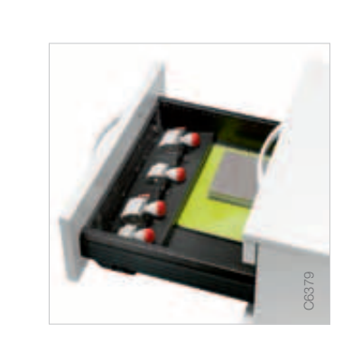
Stamp holder: Supports stamps and is flexible in use.