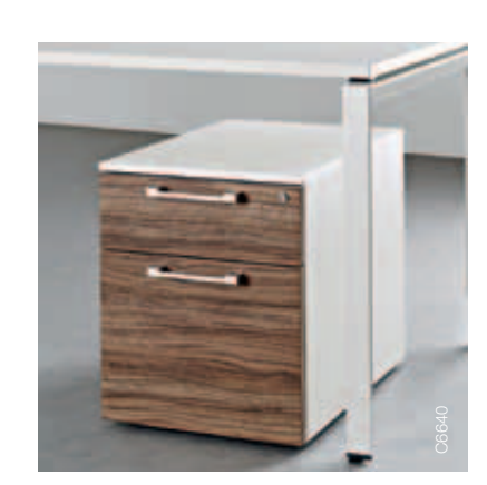
Standard mobile «9HE» pedestal Flexibility and mobility with pedestal on castors.