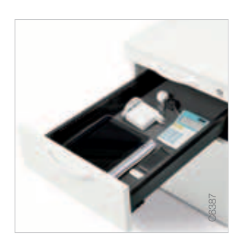
Soft mat: Protects items and reduces noise inside the drawer.