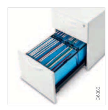
Cross rail: Helps to use file frames in different ways.