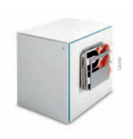
Magazine holder: A flexible tool to keep documents visible and within easy reach.