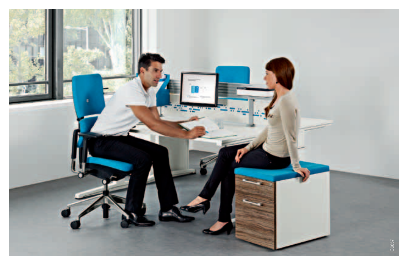
Implicit mobile pedestals with cushions, Activa desks, Please chairs, Partito Rail, Forward Arms and 1+1 Worktools.

As a mobile pedestal under or juxtaposed pedestal next to the desk to expand the worksurface, Implicit is compatible with a large range of Steelcase desks, making it easier to adapt to the changing work modes of today's business world.