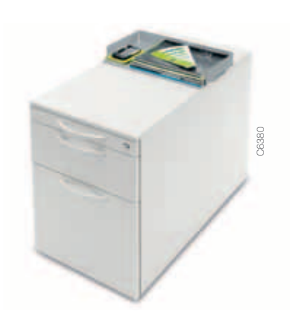
Top slider: Helps improve personal organisation on the top of the pedestal.