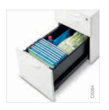
High sides: Allows to store larger objects along with suspended files.