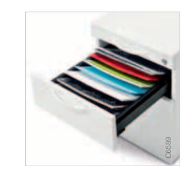
Angled paper tray: Helps you to structure paper and documents in the drawer.