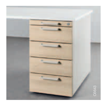
Standard supporting pedestal Replacement of desk legs and space optimisation.