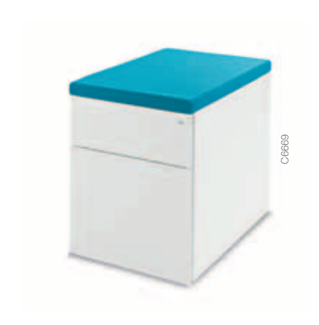
Cushion top: Supports collaboration at the desk by offering a seat for visitors and colleagues.