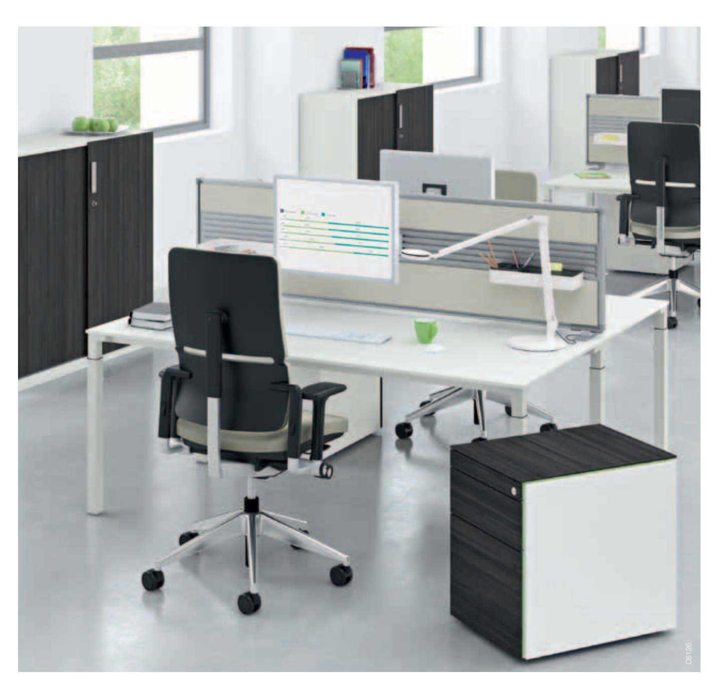
Implicit mobile pedestals and Share It storage cabinets in the same front finishes, Kalidro desks, Please chairs, Partito screens, Forward Arms, dash lamps and 1+1 Worktools.