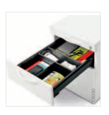
Dividers : Adapt the drawer to different user needs.