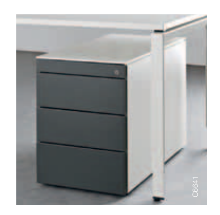
Premium mobile «10HE» pedestal Flexibility and mobility with pedestal on castors.