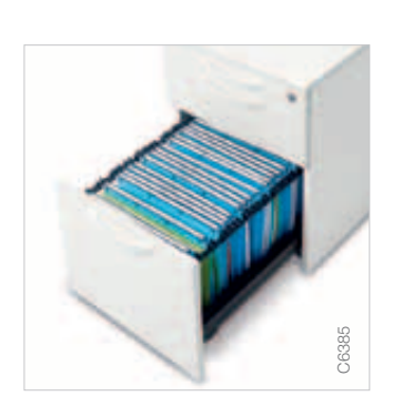
Suspended file frame: Standard for 6HE drawers.