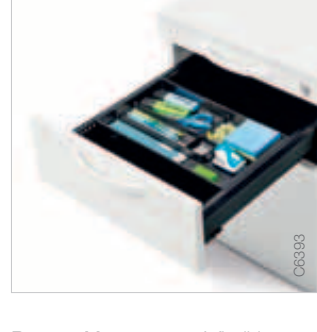
Removable pen tray: A flexible solution for your personal storage.