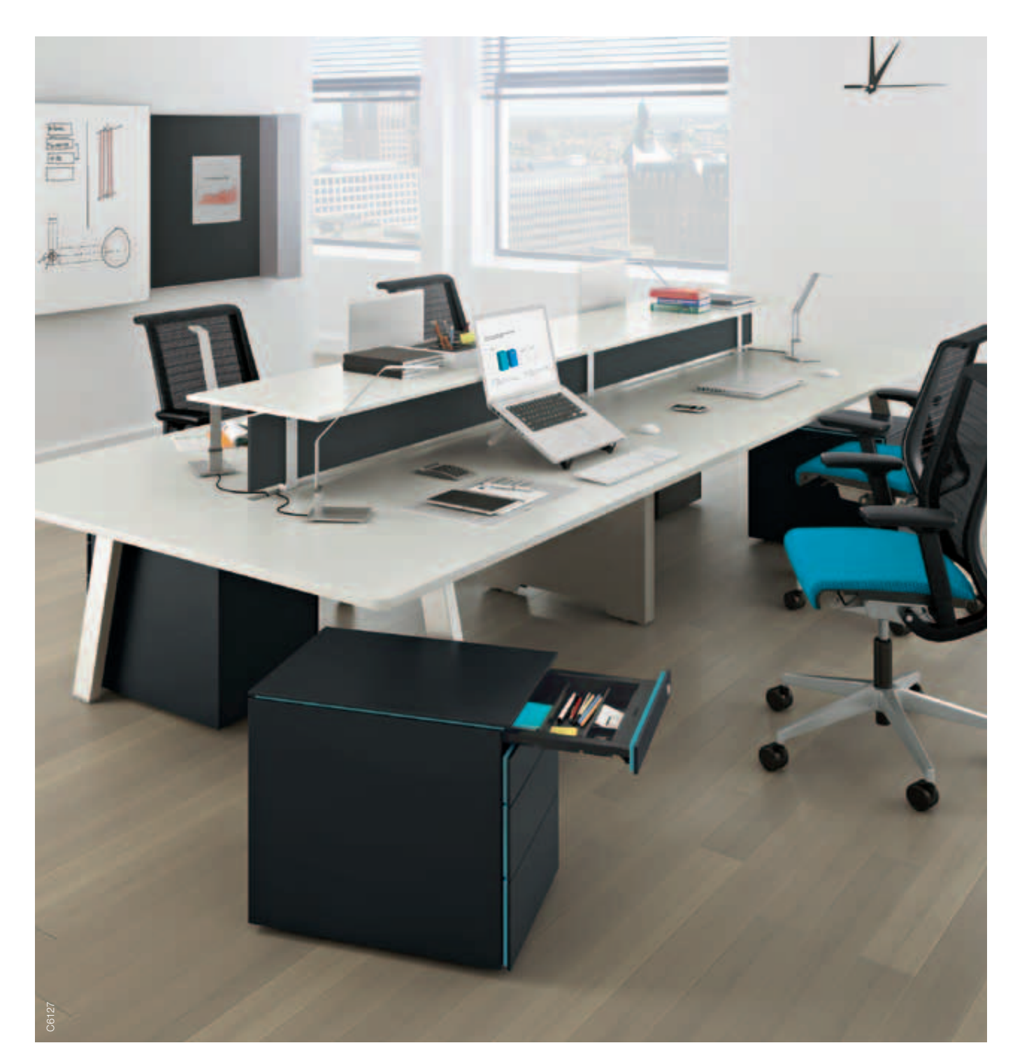
A perfect match. Implicit blends in easily with the design of the workstation and seating.

The most expressive feature on the Implicit premium model is the gap which is visible immediately under the top and on the front outer side. The gap creates an added opportunity for an accent colour.