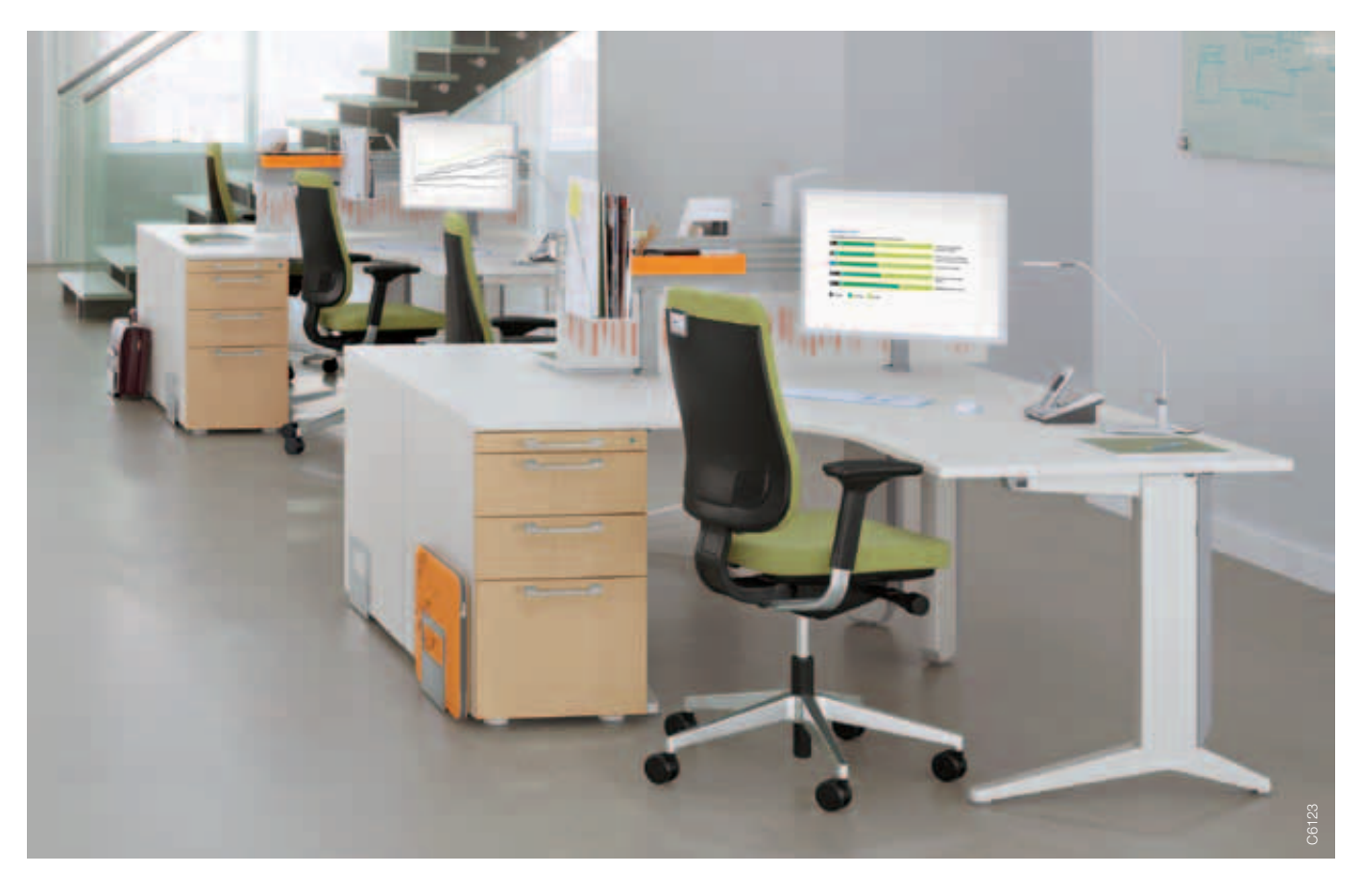
Implicit juxtaposed pedestals, Fusion C-leg desks, Partito Rails, Reply chairs, Plurio single arm, 1+1 Worktools and 1+1 LED task light, standard version.