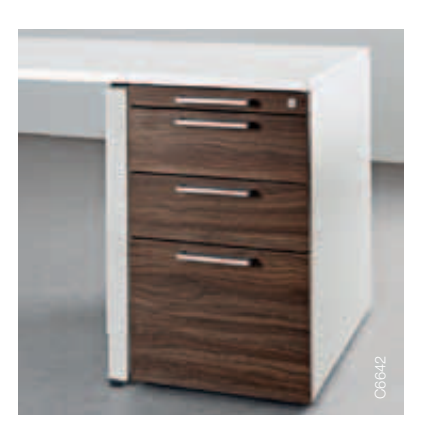
Standard juxtaposed pedestal Worksurface extension.