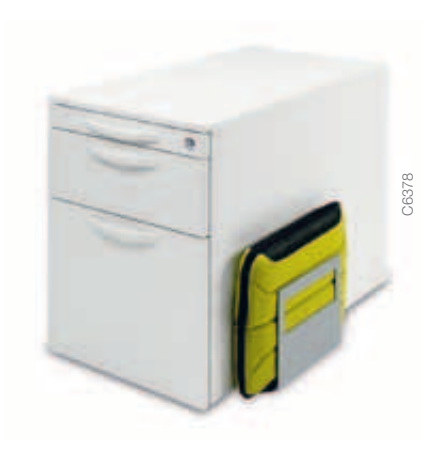
Bag holder: With the auto return mechanism, bags are kept neatly at the side of the pedestal.